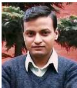
Professor Department of Hindi School of Humanities and Languages Tezpur University, Tezpur (Assam)